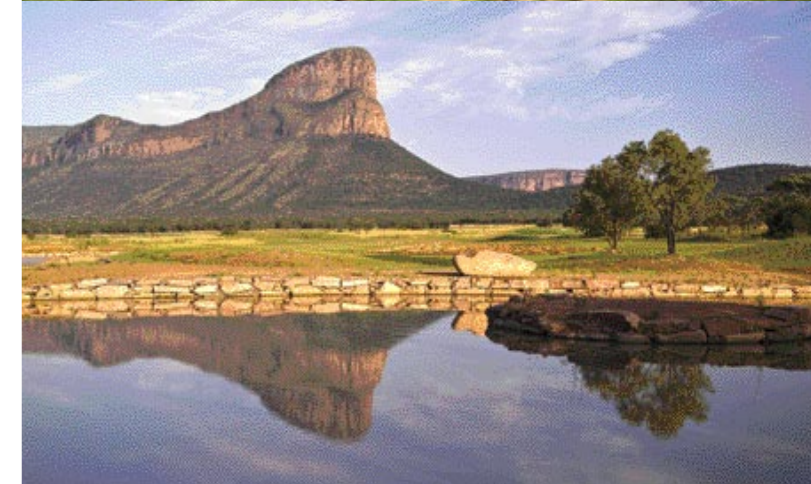
Left: Sergio Garcia at the tee of The Extreme 19th; African elephants on the march. Above: a Legend helicopter soars over Entabeni; Hanglip Mountain looms above the plains. Next page: the Legend course at sunset

THE SKIES SHAKE WITH ARROW-MARKED BABBLERS, BEE EATERS, CAPE TURTLE DOVES, AND KINGFISHERS, WHICH APPEAR AS IF BY MAGIC