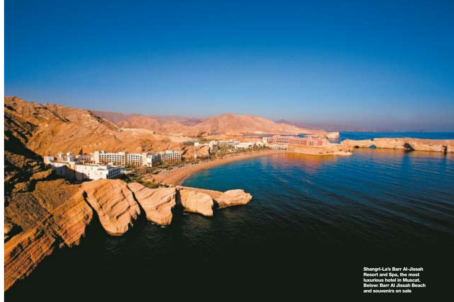
Shangri-La's Barr Al-Jissah Resort and Spa, the most luxurious hotel in Muscat. Below: Barr Al Jissah Beach and souvenirs on sale

Also highly recommended – to avoid the heat of the midday sun – is to venture into the frankincense-infused halls of the resort's onsite alluring spa retreat. With 12 villas, a vitality hydro pool, herbal steam room, tundra and tropical rain showers and an ice fountain – whatever that's for – an hour with any of CHI's massage therapists will leave any visitor feeling like a Sultan. A heady mix of lavender and jasmine oils will result in one's skin glowing like a well-fed lobster's without the need for the pain that tomorrow's sunburn will undoubtedly bring.