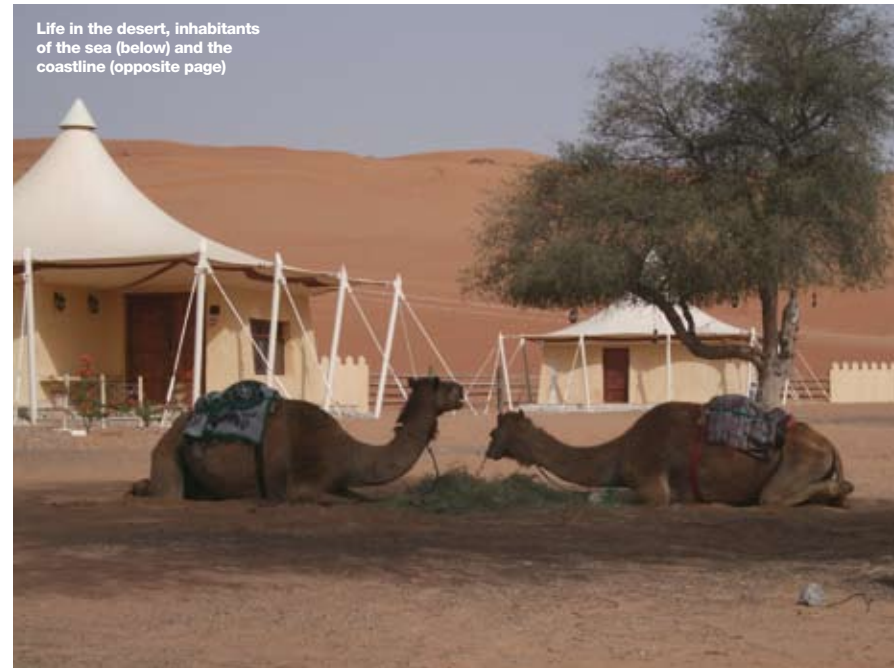
Life in the desert, inhabitants of the sea (below) and the coastline (opposite page)

Making our way back to Muscat from the periphery of the Strait of Hormuz, we leave the circus to play with its new audience. It is as satisfying as one could ask from such an early rise. Fishermen wave and steer their skeletal boats back into shore.