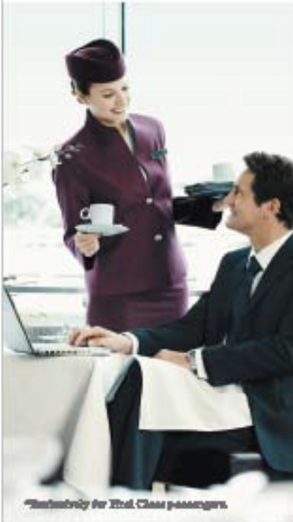
*Exclusively for First Class passengers.

At your service, inside the Premium Terminal in Doha. Uniquely designed for our First and Business Class passengers, our Premium Terminal in Doha offers spa amenities*, full office facilities, and wireless connectivity. The joy of travelling begins before you step aboard.