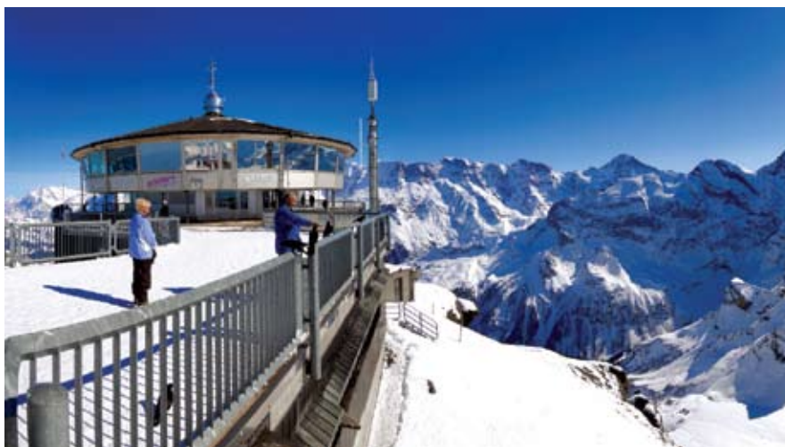
The revolving restaurant Piz Gloria was finished with money from the Bond production team in exchange for exclusive shooting rights.

OPTING OUT of the life or death thrill of skiing down the Schilthorn at break-neck speeds, I choose instead to recline on a