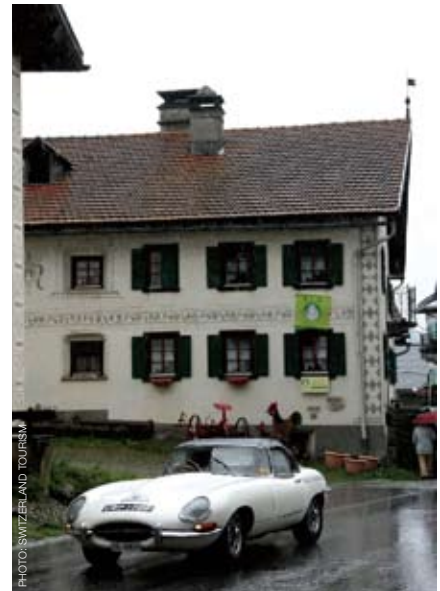
The British Classic Car Meeting in St Moritz filled the streets with 007's Aston Martins, Bentleys and other unique vehicles.