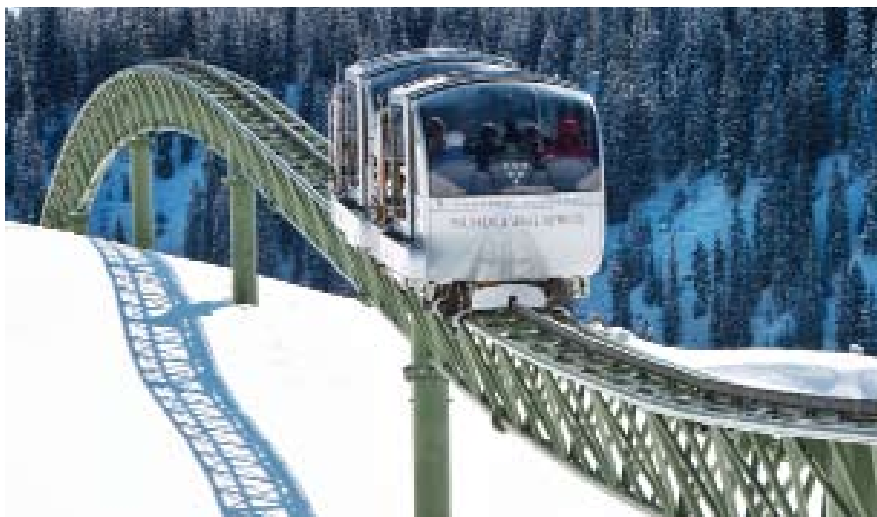
The Tschuggen Express is a private gondola that takes guests to the exclusive Tschuggen Grand Hotel.

Now home to a 007 photography exhibition, the Piz Gloria showcases behind the scenes footage, original film stills from the 1960s production and a panoramic Touristorama theatre, so the setting is perhaps the best place in the Alps for a lunch of Stavro Blofeld entrecote from Argentina or James Bond 007 spaghetti. It's a great spot to enjoy more than 200 summits including the