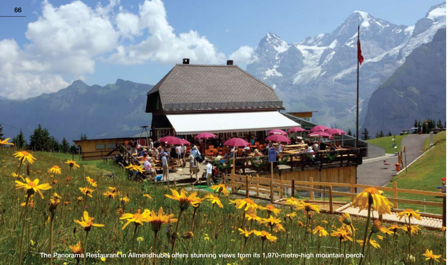
The Panorama Restaurant in Allmendhubel offers stunning views from its 1,970-metre-high mountain perch.