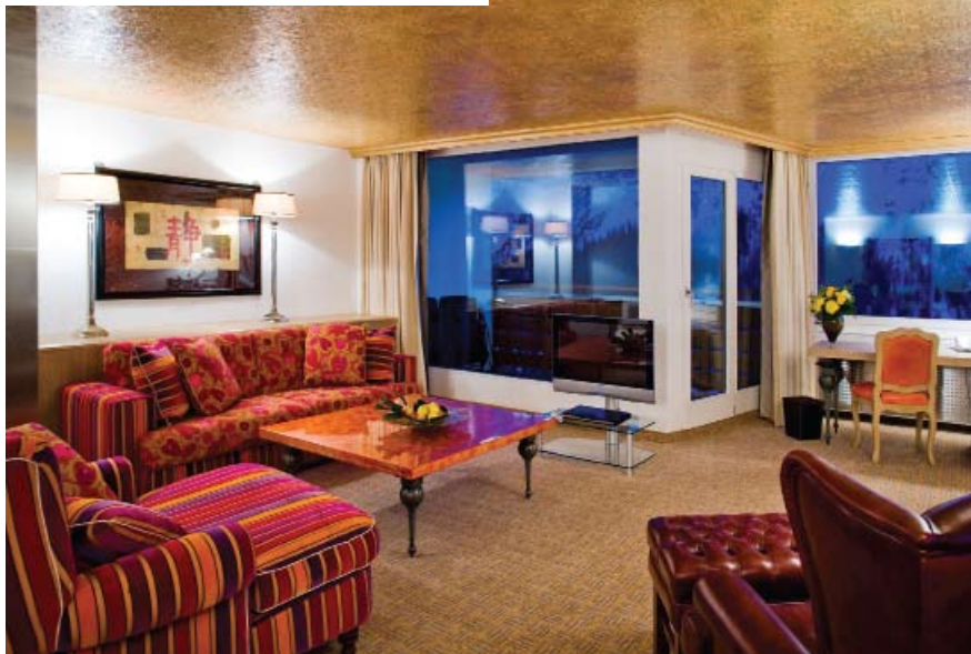
Above and left: Bond would feel at home in the Tschuggen Grand Hotel, which is built into a mountain side. Besides luxurious suites it also offers the finest gastronomy.