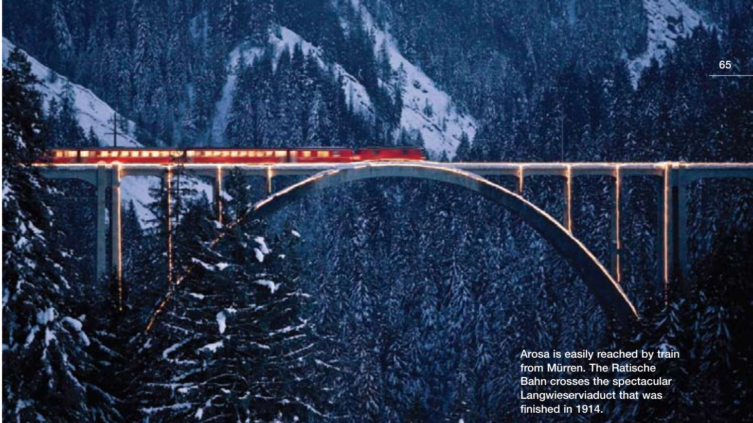
Arosa is easily reached by train from Mürren. The Rätische Bahn crosses the spectacular Langwieserviaduct that was finished in 1914.