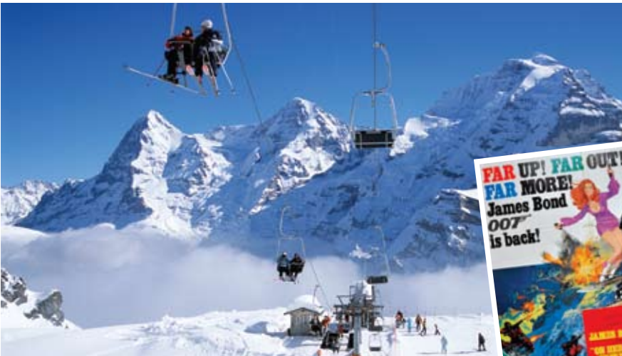
Mürren, in the Bernese Oberland, has a view of the Eiger, Mönch and Jungfrau – the backdrop to many a movie.

George Lazenby may have faded into memory as the worst James Bond in history but at least he was rewarded with the best 007 film set in the 22 film series. Like an old sepia film print, the initial sight of Mürren, with its chocolate box churches and chalets, will live much longer in the memory than poor old George ever will. Populated by the Swiss banking set's finest whilst on their annual spring breaks – Zurich and Bern are two hours and one hour away respectively, either by train or Aston Martin – Mürren offers an