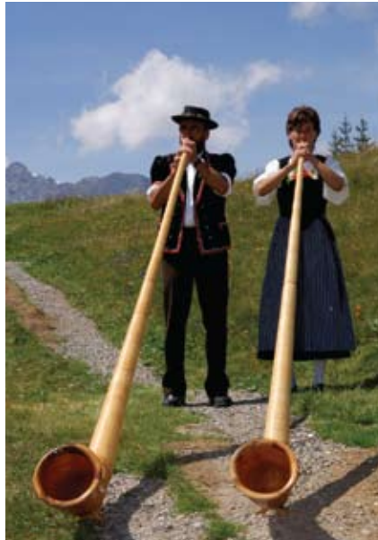
Traditionally, alphorns were used to communicate over long distances in the Alps. Today, they're more of a tourist attraction.

“Designed by acclaimed architect Mario Botta, the roof, with its opulent filigree sails in glass and steel, is reminiscent of an opera house, yet blends harmoniously with the surrounding evergreens.”