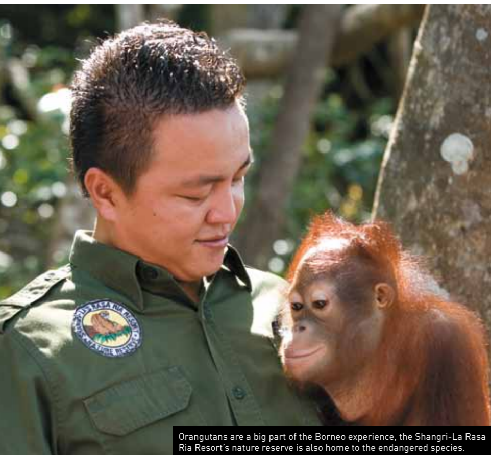
Orangutans are a big part of the Borneo experience, the Shangri-La Rasa Ria Resort's nature reserve is also home to the endangered species.

WWW.SHANGRI-LA.COM/EN/PROPERTY/KOTAKINABALU/RASARIARESORT WWW.RESPONSIBLETRAVEL.COM