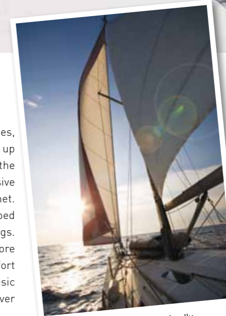
Sailing holidays are an eco-friendly vacation option.