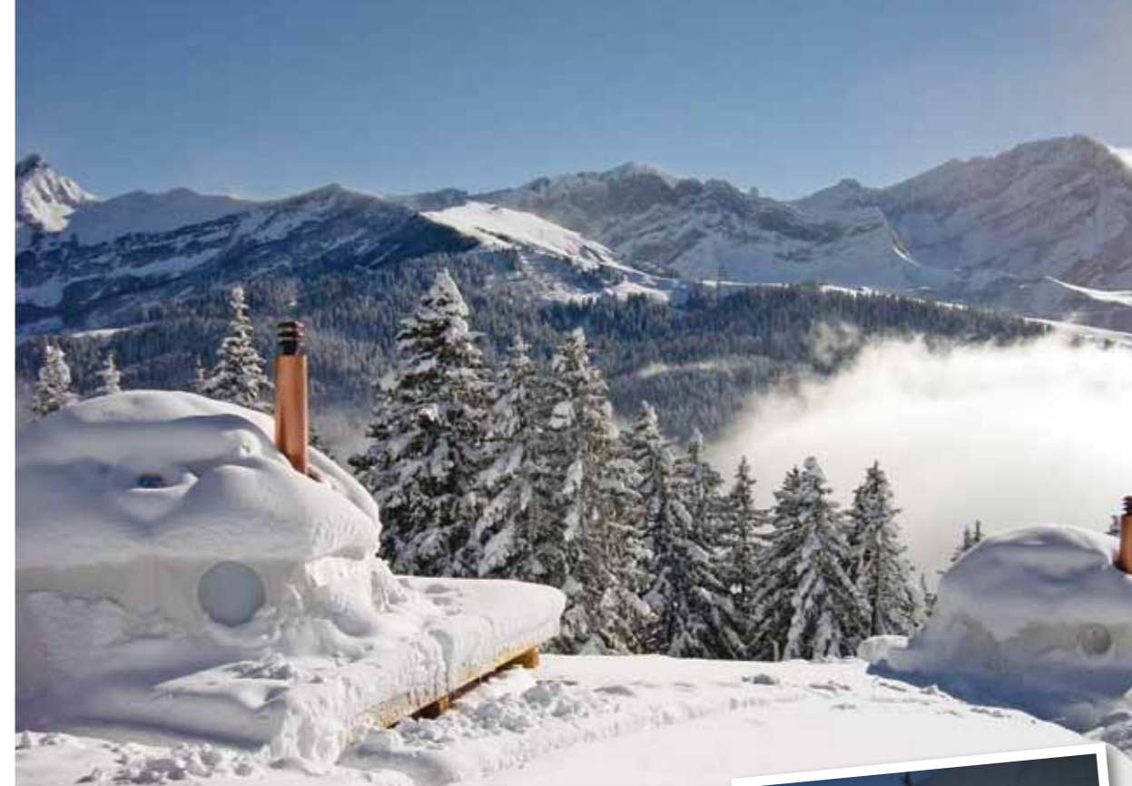
Above & below: Whitepod provides a scenic eco-experience as only Switzerland can.