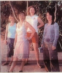
HOLIDAY NIGHTMARE: The party of adventurers whose island paradise trip to Tanzania turned to one of terror

before the bandits fled, but some of the holidaymakers made a move for several hours until they were sure their captives had left.