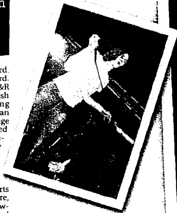
From left, clockwise, Red Bee Society, Allegro, Certain Death and The Cinematics

In the dark of the T Break tent, the first pint is not going down well. Dingwall has never been known to rock in the 200-odd years of its existence, and unfortunately, it's not about to start now. The Cinematics are sexy as hell and deserve to be in your kid sister's poster collection, but the matinee show of generic rock proves to be as inspiring as their decidedly un-cinematic name. Gaining impressive radio credits from emaciated